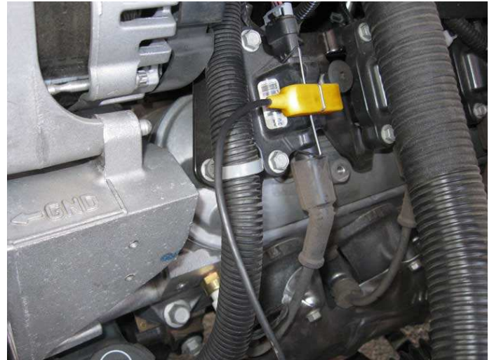
Coil Near Plug