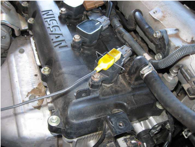
Coil on Plug