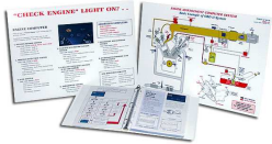
Livres, CD / DVD